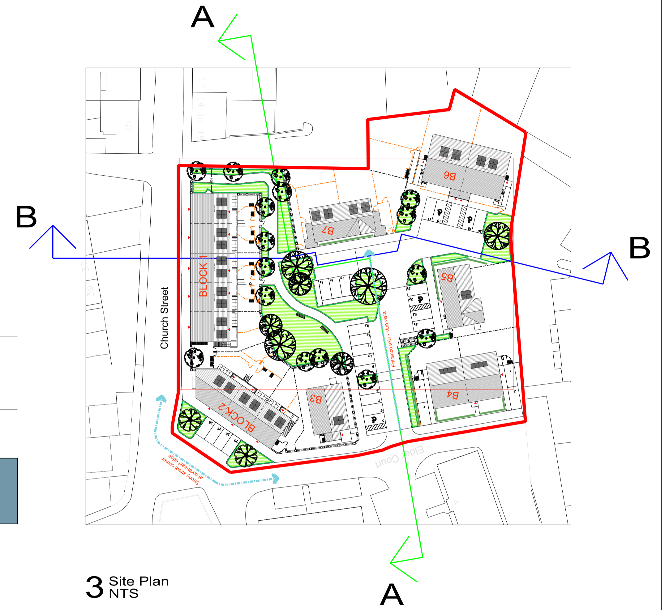
3 Site Plan NTS