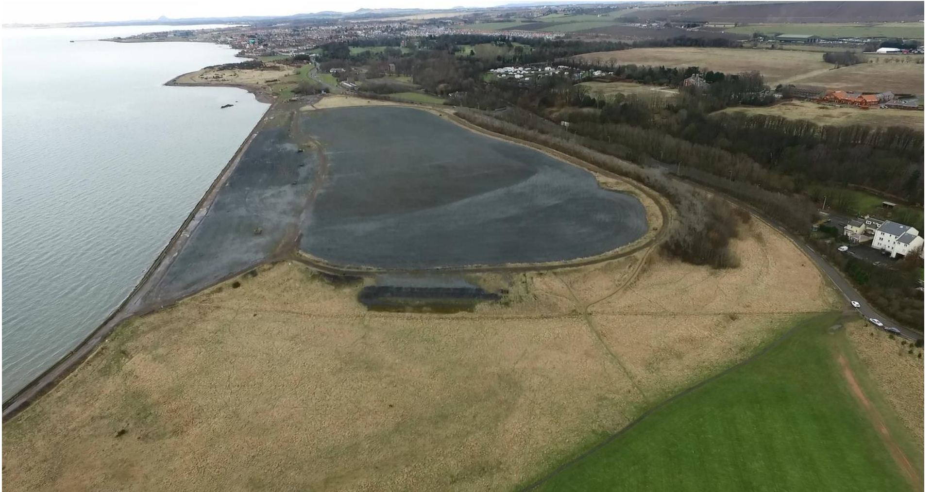
Overview of Lagoon 6 looking east