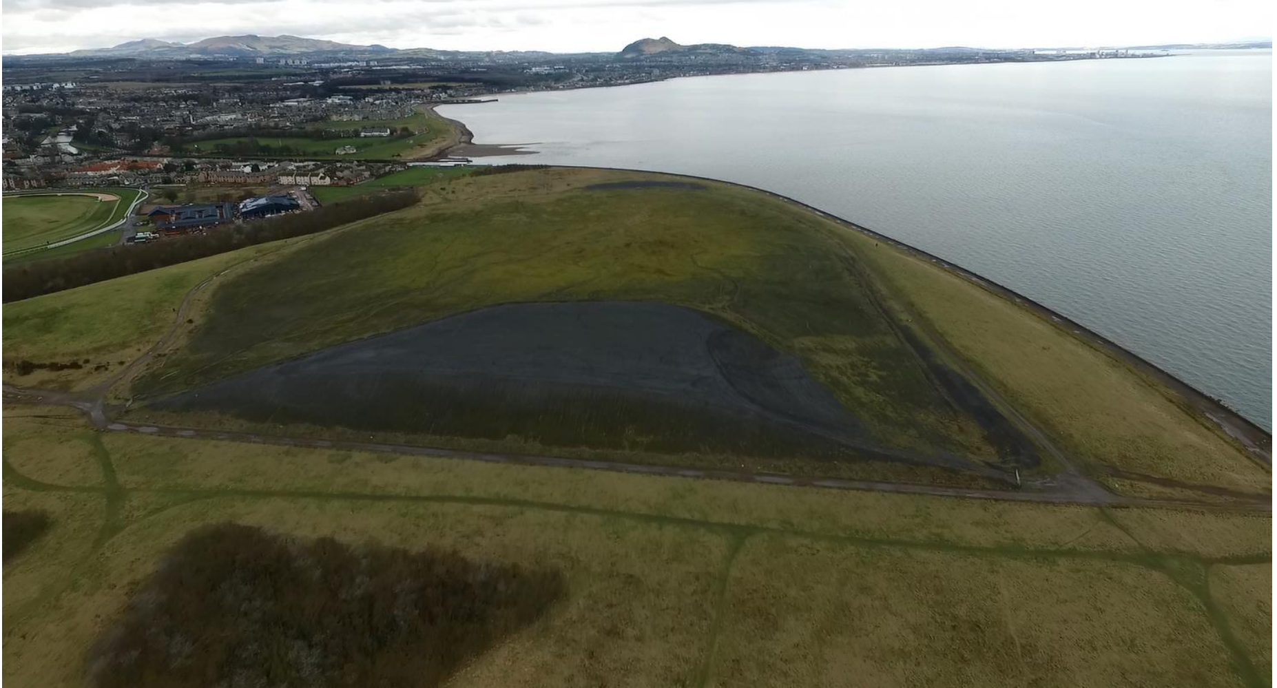
Overview of Lagoon 8 looking west